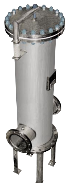
P-Series vessel fabricated from Hastelloy®